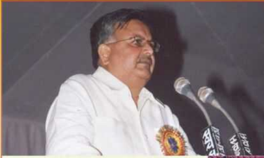
Former Hon. Chief Minister of Chhattisgarh Dr. Raman Singh addressing the audience of Kerala Samajam.